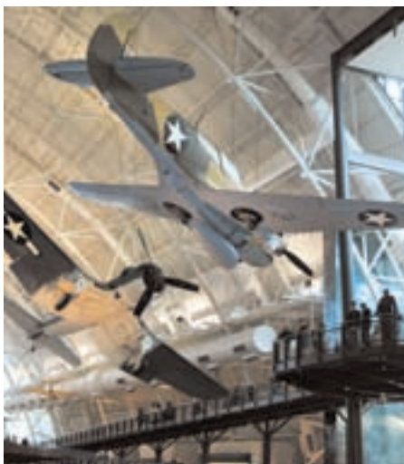
Smithsonian Air and Space Museum

For those of you on the East Coast, did you know you live in a hot bed of history? Of course you did. So make your way to D.C. already! The 19 museums of the Smithsonian Institution are all absolutely free, a cultural experience that could make up your entire vacation. There's something for every child and adult, from airplanes to mammoths to postage stamps. If you or your children are fans of the recent Night at the Museum movies, challenge each other to find the famous exhibits from the latest film. If you haven't had your fill of history, a walking trip around the city is sure to find you more monuments and historical sites than can be fit into one day. Lots of hotels in the area offer military discounts or consider staying outside the city and hopping on the Metro to save on cash. No matter how you get there, your family will definitely leave full of knowledge and fun. Visit www.si.edu for more information.