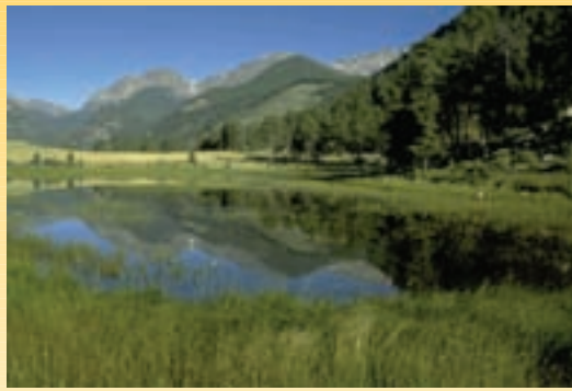
Sheeps Lake, Colorado

Billie Swamp Safari, located on the Big Cypress Seminole Indian Reservation in Clewiston, Fla., invites you to explore 2,200 acres of the Florida Everglades, swampy style. Tours run day and night, along with an alligator and snake show. After campfire storytelling, if you're a true adventurer, you can head back to your Chickee lodge