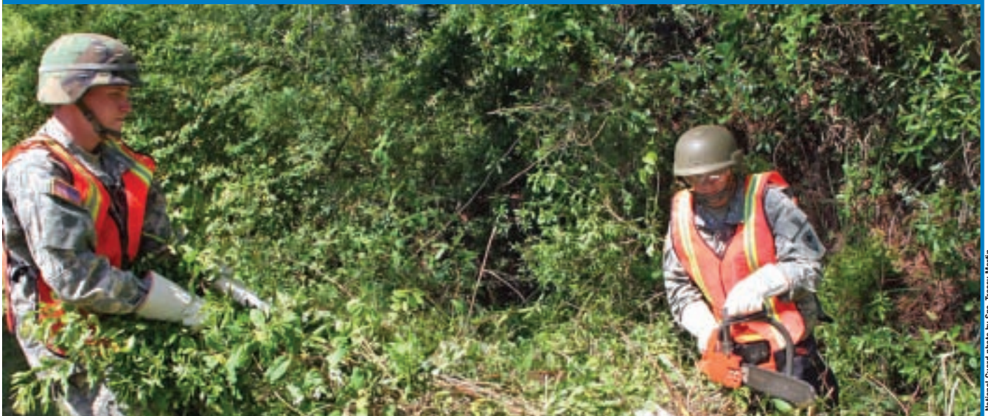
Two soldiers from Detachment 1 of the 1221st Engineer Battalion (Route Clearance), a South Carolina National Guard unit from Batesburg, clear debris from a creek that during a training scenario has overflowed the banks in a Beaufort County community. Vigilant Guard 2008 gave these soldiers an opportunity to accomplish a real-world mission in a training environment that resulted in a direct improvement for the community.