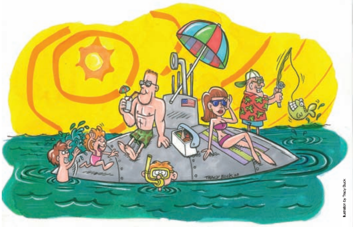
Illustration by Tracy Buck