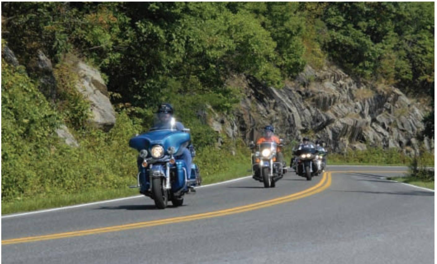
Harley-Davidson riders enjoy cruising a mountain pass during the Road Candy Tour of Harley Owner's Group (H.O.G.)

needed training. In September of 2008, a Fort Rucker, Alabama soldier died when he lost control of his new motorcycle in a curve. Although wearing a helmet, it didn't help when he was ejected off the bike and hit a light pole. He hadn't attended any motorcycle safety courses and didn't have a motorcycle-class license.