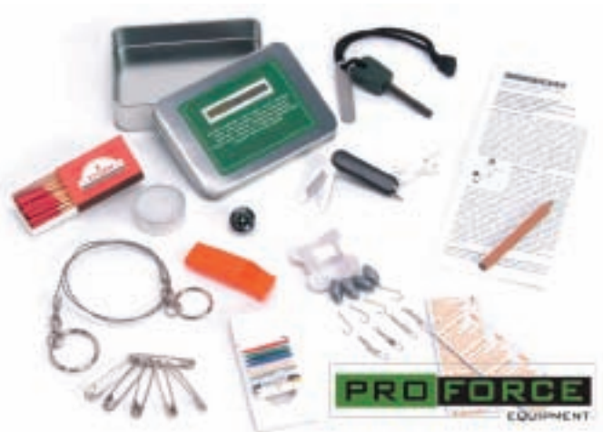
SAS Survival Tin

The white nylon cord isn't bad, but the 150-pound strength falls far short of the power of 550 cord. The included scalpel blade has many functional uses, although the lack of handle can make for accidental cuts and other problems. You can find the Pocket Survival Pak at www.adventuremedicalkits.com ($33).